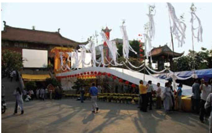
Left: A ceremonial bridge constructed at the Saigon temple for the Grand Requiem Mass, symbolizing a route for departed souls to pass from suffering. Right: Thich Nhat Hanh arrives at Tu Hieu, the temple where he became a novice monk.

After a silent, meditative breakfast with the other international sangha members in our hotel restaurant, we take a bus to the Phap Van temple, the base for Thay’s Engaged Buddhism back in the sixties. A swarm of cameras greets the stately arrival of Thich Nhat Hanh, who leads us on a slow, calming, walking meditation. Then we gather in the dining hall to receive our robes and alms bowl. I’ve always been drawn to the simplicity and focus I’ve witnessed in monastics, particularly in the joyous Plum Village sangha, and I’m thrilled with this opportunity to be a semi-monk for a month. I look around at my new traveling companions—seventy foreigners from around the world—all dressed up in light blue robes, tentative and slightly awed by this sudden transformation. We are no longer civilians.